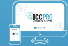
ICC PRO & Web Application